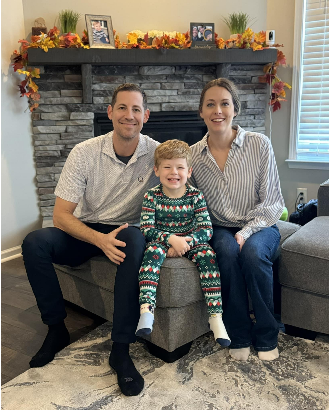
Family Adventures in Austria: A Memorable Journey