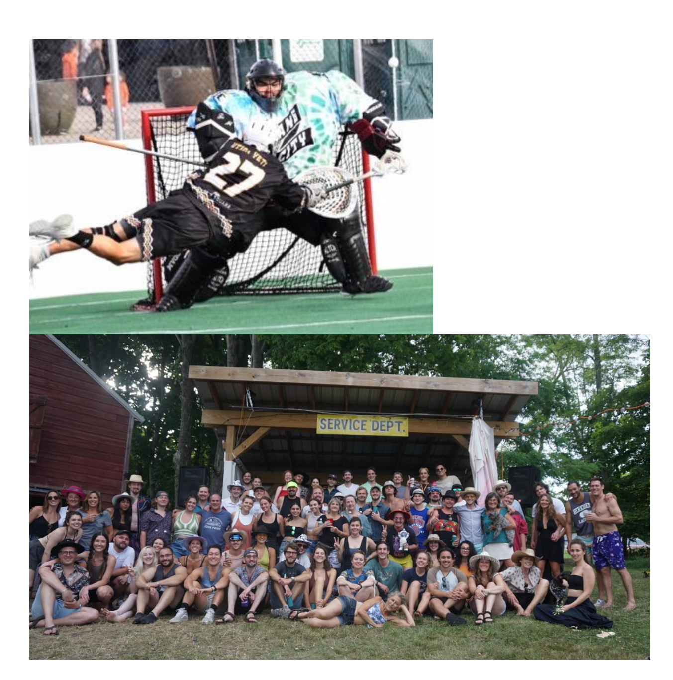
Cameron Adventures Abroad and Stateside