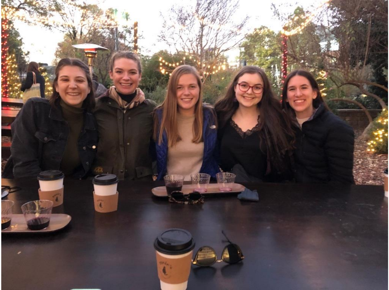
Friendsgiving in Charlotte