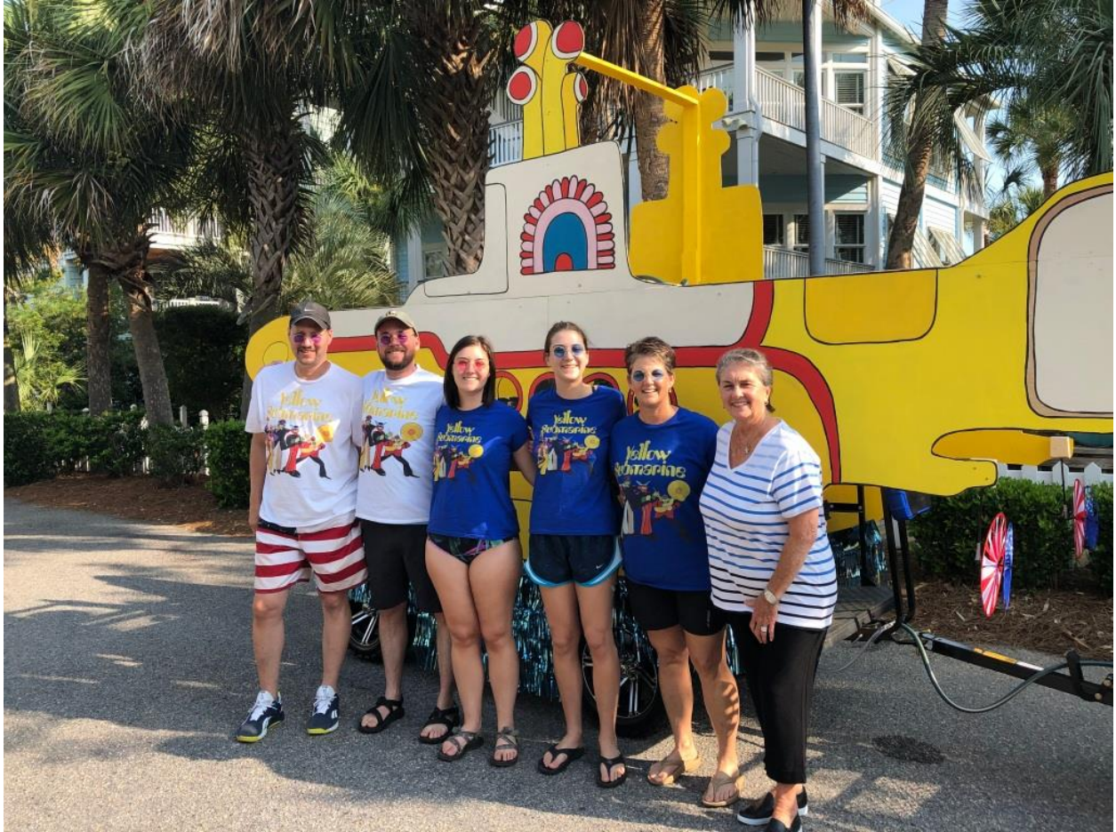
Yellow Submarine float for July 4th