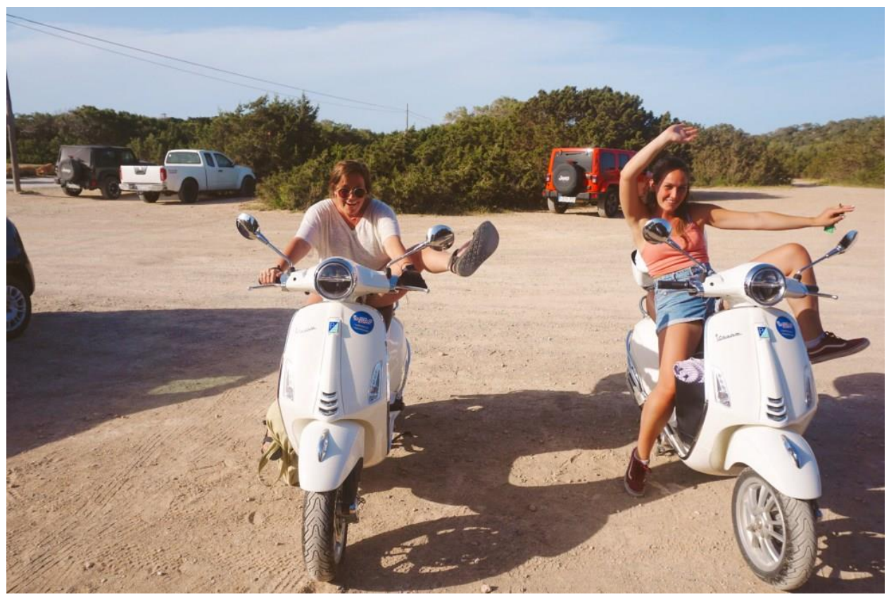
Vespas in Ibiza