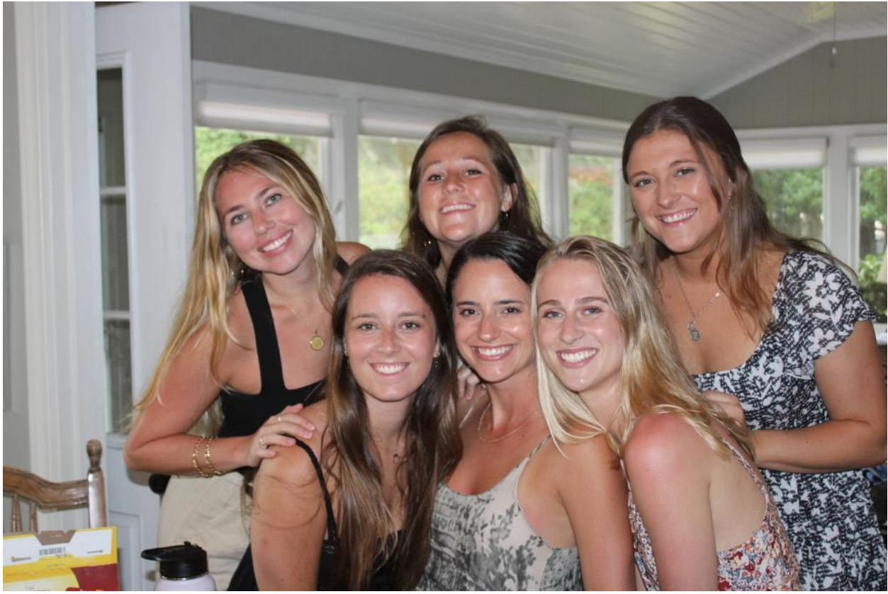
Friends in New Bern for Memorial