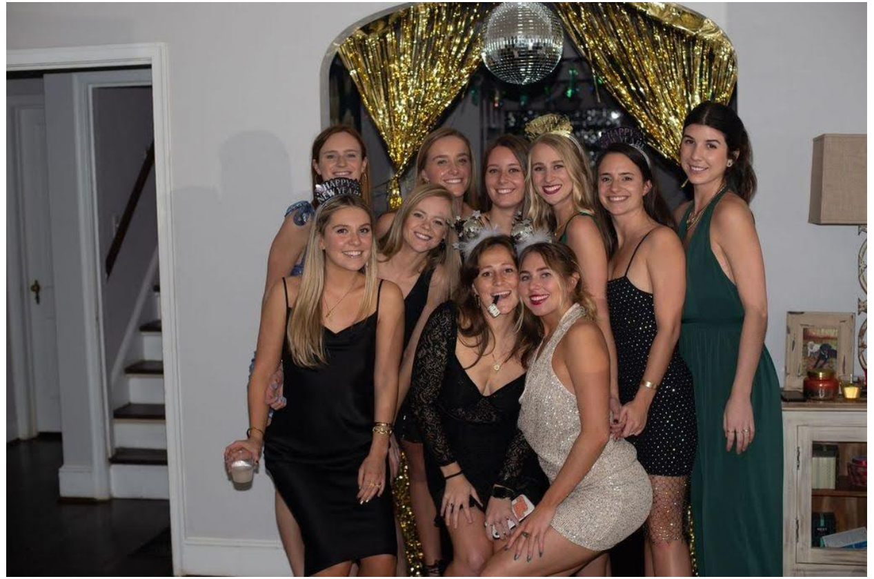
New Years 2021 in Charlotte, NC